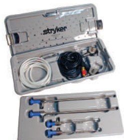
Endoscope and Camera Sterilization Tray