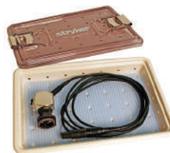
Autoclavable Camera Tray